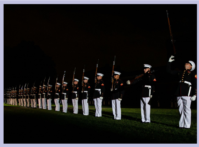
May 13, 2022 - Marine Barracks Washington Marines with the Silent Drill Platoon execute their "long line" sequence during a Friday Evening Parade at Marine Barracks Washington, D.C.