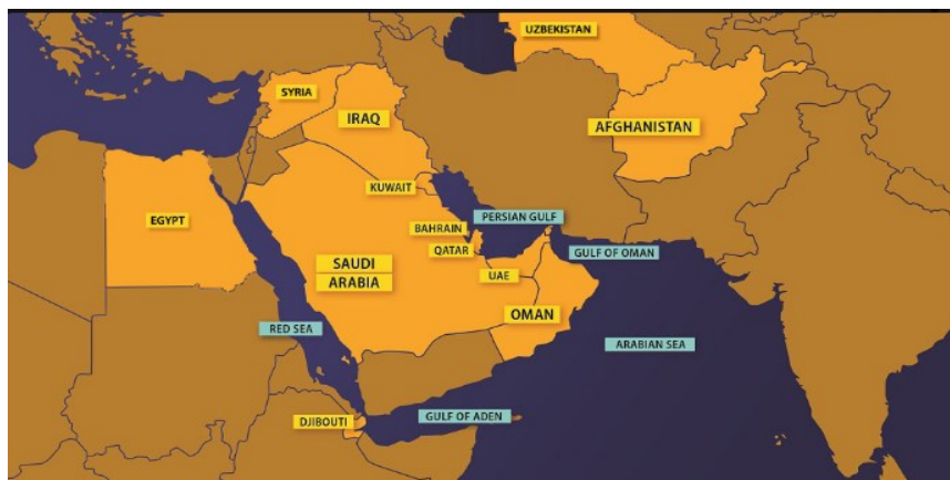
Map of countries and bodies of water currently included in the VA Airborne Hazards and open Burn Pits Registry.

Researchers, including experts at VA, are actively studying airborne hazards like burn pits and other military environmental exposures. Ongoing research will help us better understand potential long-term health effects and provide you with better care and services. Many health conditions related to these hazards are temporary and should disappear after the exposure ends. Other longer-term health issues may be caused by a combination of hazardous exposures, injuries, or illnesses you may have experienced during your military service including blast or noise injuries.